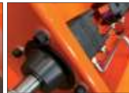
4 hydraulic engines with hydrostatic braking system