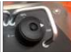
Power setting from 10% to 100%