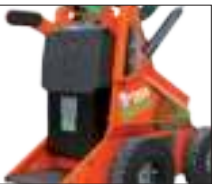
36V battery: better performance and less overheating

www.tnedistributing.com info@tnedistributing.com