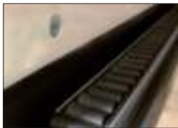
Battery replaceable in 5 minutes thanks to QEX quick extraction rail