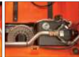
High efficiency engine